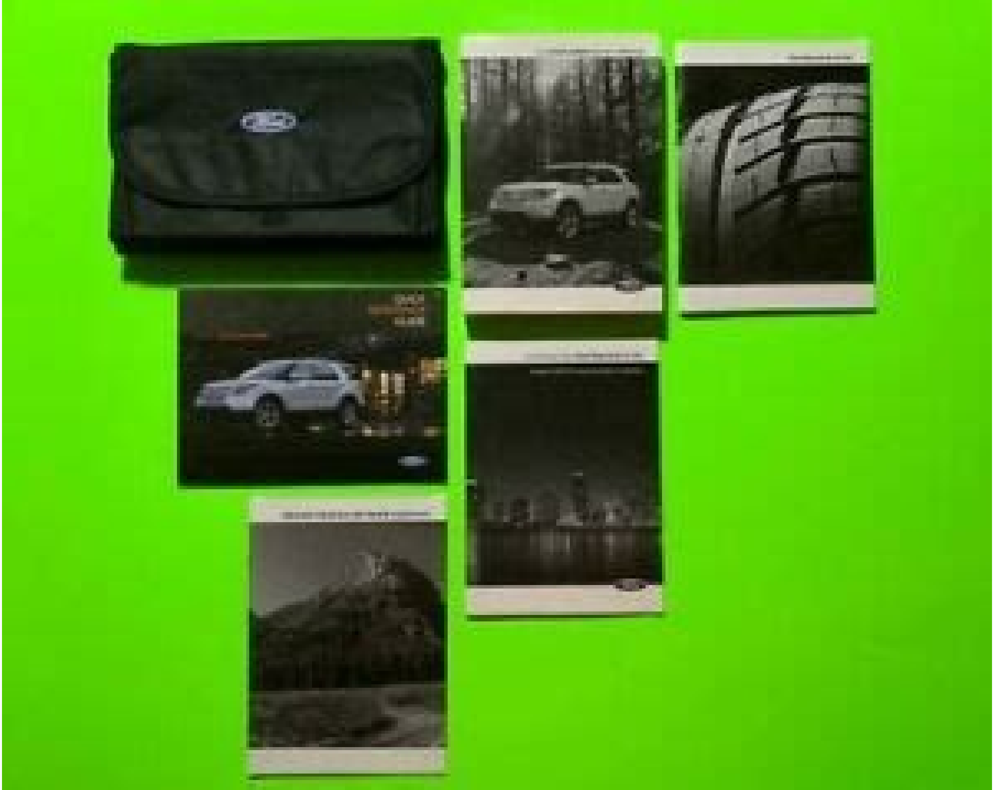
2017 ford explorer factory code. 2013 ford explorer factory service manual. How to manually start ford explorer. 2009 ford explorer maintenance schedule. 2006 ford explorer maintenance schedule. Ford explorer service reset. 2016 ford explorer factory service manual.